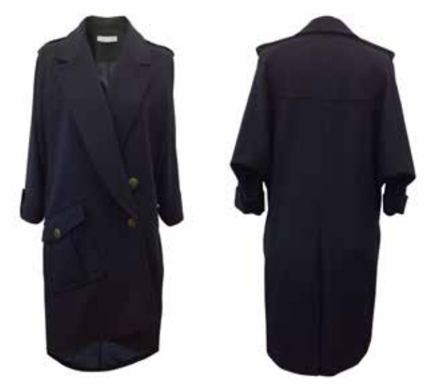
MILITARY TRENCH COAT