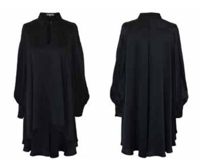
Fabric: Washed Silk Colour: Black, Burgundy, Indigo, Antique Brass