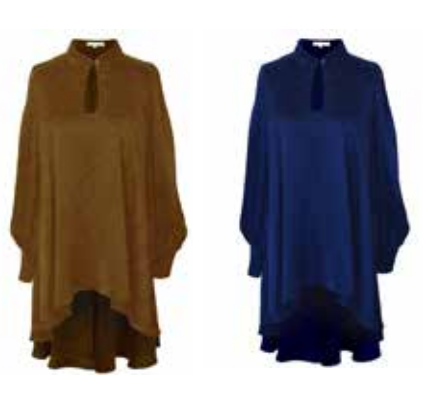
Fabric: Silk Crepe De Chine Colour: Burgundy, Indigo, Antique Brass