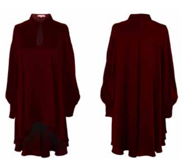
PAINTER'S SHIRT NARROW SLEEVE