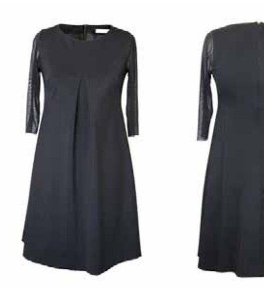
LITTLE BLACK DRESS