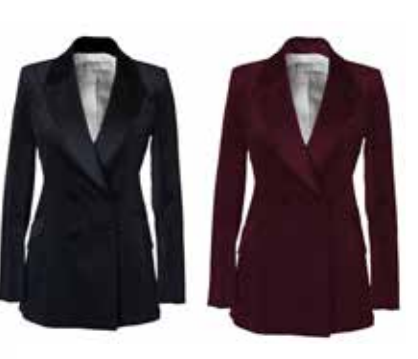
Fabric: Viscose Velvet Colour: Pewter, Burgundy, Midnight